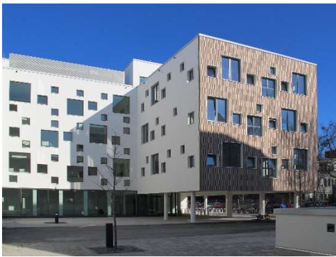
Figure 3: T-Building of MUAS

The EECI M04 course will take place on the ground floor of the T-building of MUAS, which is located at Dachauer Straße 100a, 80636 Munich. It is located right behind the X-building.