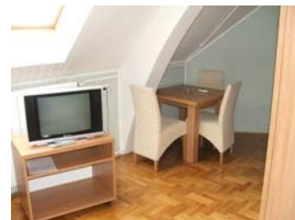
Konak kralj Aleksandar room pictures