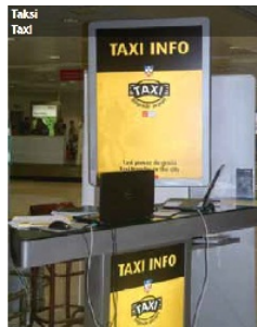
TAXI INFO desk

Please take a taxi receipt at the information desk which contains the name of your destination and appropriate price for the taxi service! School of Electrical Engineering and all hotels which will be recommended in this guide are in second taxi zone and the price is 1800 dinars (around 15 euro). Serbian currency is Dinar and you should exchange some money at the airport for the bus or taxi services.