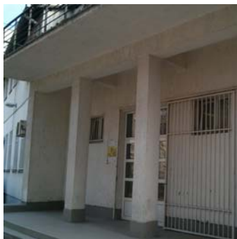
Entrance to Pavilion Rašović

https://maps.google.com/maps?f=q&source=s_q&hl=en&geocode=&q=pavilion+rasovic,+belgrade,+serbia&aq=&sll=44.815245,20.420322&sspn=0.007436,0.016512&vpsrc=0&t=h&ie=UTF8&hq=&hnear=Pavilion+%22Ra%C5%A1ovi%C4%87%22,+Belgrade,+City+of+Belgrade,+Serbia&z=17&iwloc=A